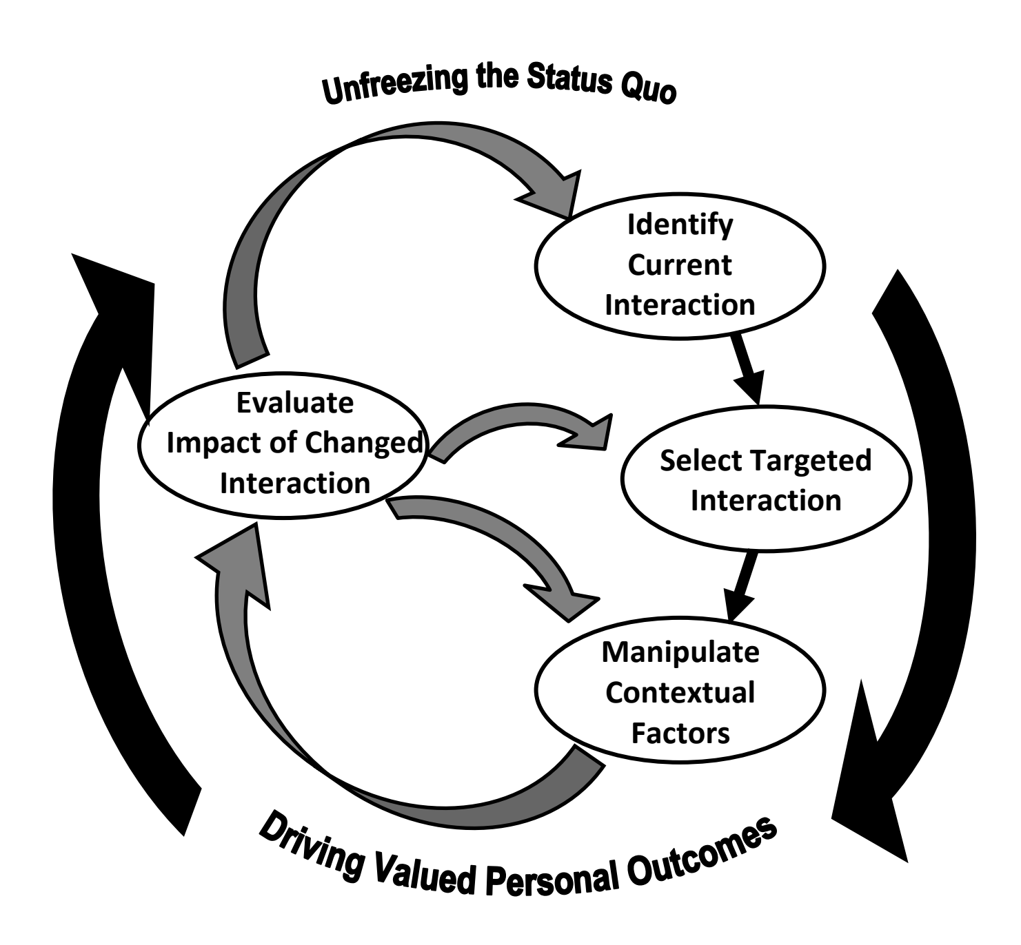
Figure 3. Context-Based Enhancement Cycle