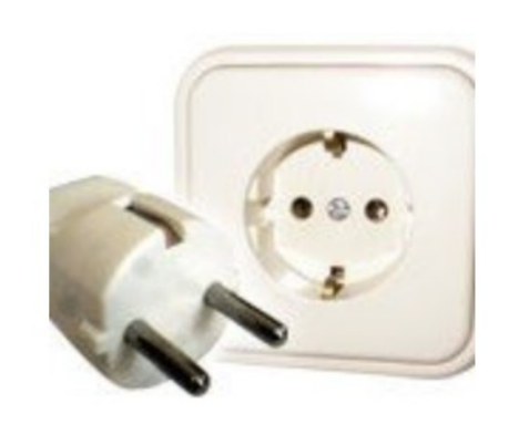
Type F: This socket also works with plug C and E