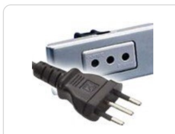
Type L: This socket also works with plug C