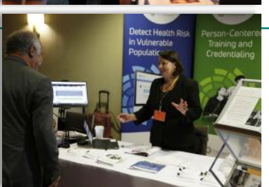
EXHIBIT MOVE OUT